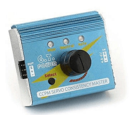
RC Servo Tester

In the interest of demonstrating your completed launcher, you may wish to obtain a RC servo tester (pictured below). This device will allow you to manually operate the servo by rotating a knob on the tester. These devices are available from a number of retail suppliers including RC hobby stores and independent outlets, some costing as little as $10. (Servo testers require a suitable power source, typically 4.8VDC to 6VDC. Consult the retail supplier and/or appropriate documentation for details.)